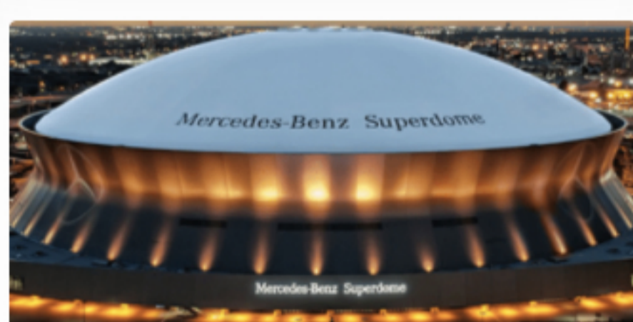
SMG NEW ORLEANS - NEW ORLEANS SUPERDOME

Installation of fiber, access control and wireless radios up and down river.