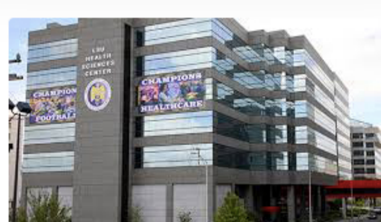
LSU HEALTH & SCIENCES CENTER