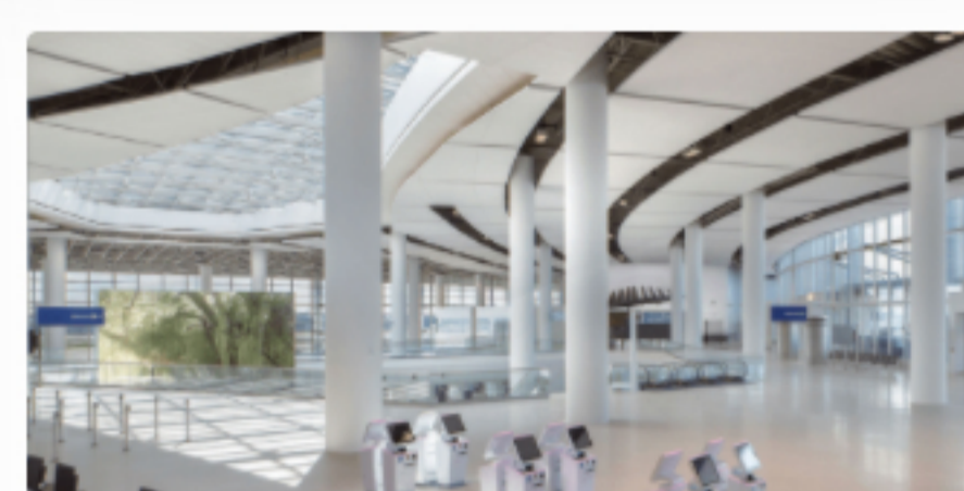
NEW ORLEANS ARMSTRONG NEW NORTH TERMINAL AIRPORT

Installation of 150 DATA drops for pole mounted scanners to scan patron's tickets as they come through the gates for an event. Installation of 350 DATA drops and wireless (DAS) in the Dome. Installation of conduit cabling for new parking garage equipment and replacement of CCTV (VMS) head END equipment for the Dome.