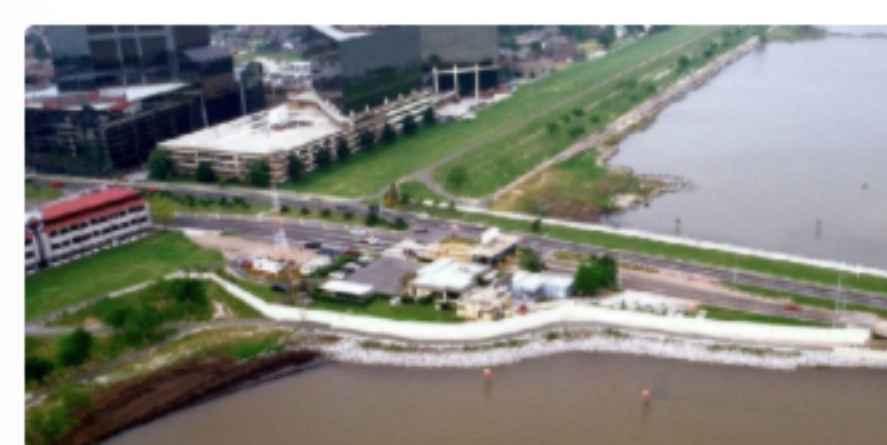
LAKE PONTCHARTRAIN CAUSEWAY BRIDGE

Installation of Cable Tray, Data, Fiber Voice, CCTV and Access Control Cabling for ten (10) floors of Office building space "One Shell Square Building". Also Install Cabling, Hardware, and Wireless Access Points for (DAS) Distribution Antenna System on all ten (10) floors as well as remote branches.